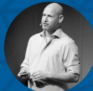
Joe Lubin Founder, ConsenSys Co-Founder, Ethereum