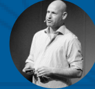
Joe Lubin Founder, ConsenSys Co-Founder, Ethereum