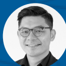
Jason Hsu At-Large Legislator of the 9th Legislative Yuan, Taiwan