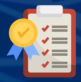
50 Technical Standards Bodies and their frameworks