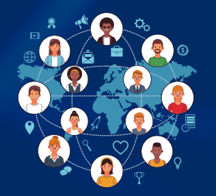
2,000+ Stakeholders in Industry Landscape